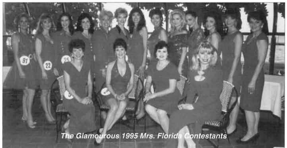
The Glamorous 1995 Mrs. Florida Contestants